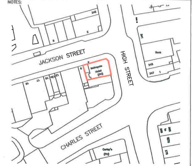
SITE LOCATION PLAN @ 1:1250 (NORTH UP)

Copyright. This drawing and design and all the information contained therein is the sole copyright of Innes Design Limited, and reproduction in any form is forbidden unless permission is obtained in writing. Warning. No dimensions to be scaled from this drawing. All contractors must visit site and be responsible for taking and checking all dimensions relative to this work. The designer must be advised of any discrepancies in writing. This drawing must be read in conjunction with the specifications/bill of quantities and related drawings. Any structural work must be carried out to meet specification and requirements of the client's appointed structural engineer and any amendments must have his express prior written authority. All structural work must be inspected at all relevant stages by the structural engineer and by the Appointed Building Surveyor, and comply with their requirements. Any cost and claims for damages, loss of trade, etc., incurred by failing to do so are the sole liability of the contractor.